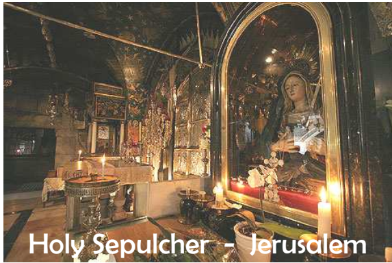
Holy Sepulcher – Jerusalem

called Good. What spectacle could be more ridiculous than armed soldiers keeping their eyes on a corpse? But sentinels were set, lest the Dead walk, the Silent speak, and the Pierced Heart quicken to the throb of life. They said He was dead; they knew He was dead; they would say He would not rise again; and